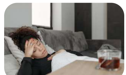
Enhanced sick pay

After completing five years of service: Six months' full pay and six months' half pay.