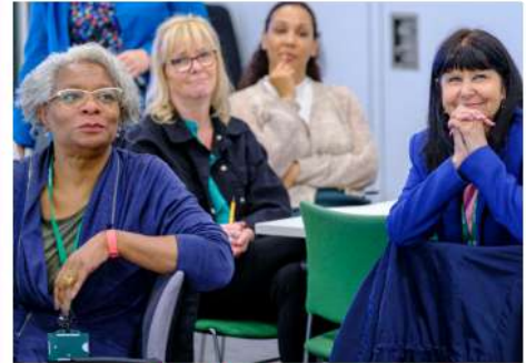
Staff learning and development directory 2026