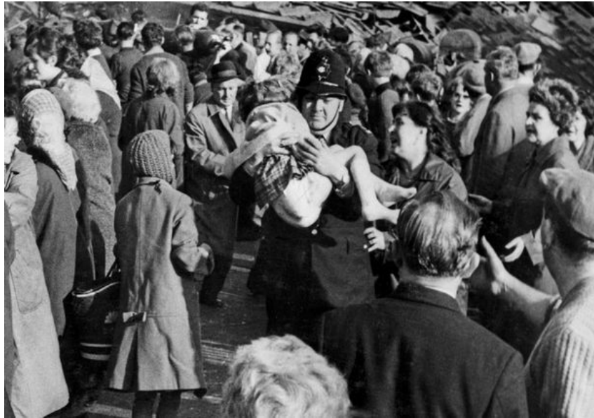
1966: Aberfan 144 dead