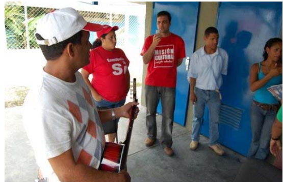
A Cuban music teacher with whom we sang Guantanamera