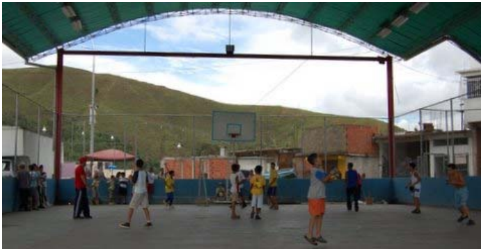
A new sports pitch where basketball training was being given by Cuban volunteers.