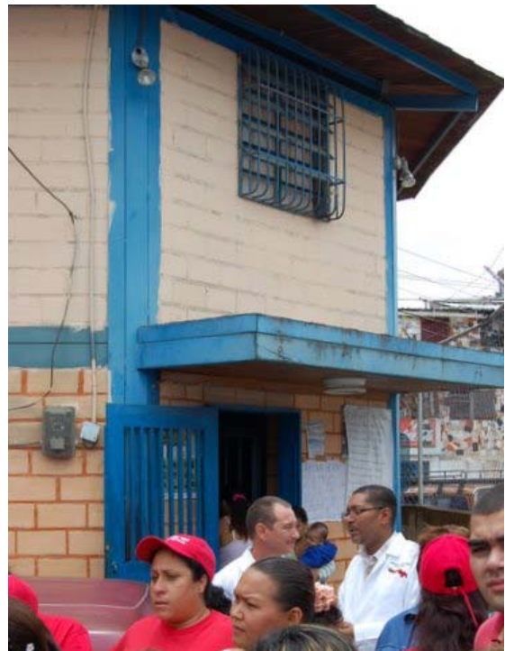
Local health clinic in Caricuao, with two Cuban doctors and residents

When they opened they were treating people who have never seen a doctor. A lot of untreated diseases were detected, like diabetes and hypertension, and a lot of lives saved. Treatment is free; medicines are made in Cuba.