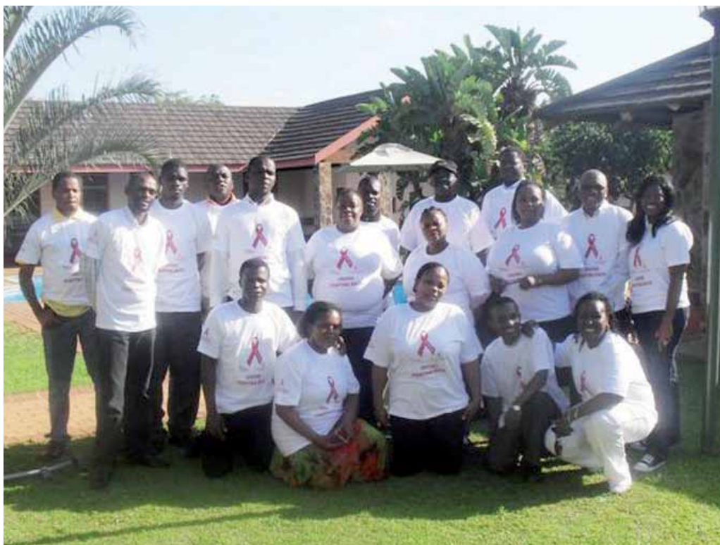
National Seminar in Swaziland, November 2010

Partner unions gave high priority to defending the rights of those directly affected by HIV, including carers as well as workers living with HIV, whether openly or not – in particular the rights to continued employment, to non-discrimination, to confidentiality, and to ARV treatment, care and support. In Namibia a priority was to ‘normalise’ the epidemic so that it could be discussed openly, thus reducing stigma and discrimination. Union strategies on rights took a multi-level approach: