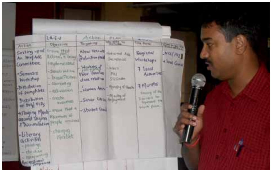
Union activist presenting union plan during national seminar on HIV/AIDS in Mauritius, February 2010.

All the unions were committed to the introduction of workplace policies and programmes 2 on HIV, but understood the benefits of linking the issue to other concerns such as occupational safety and health (OSH) or gender equality and making use of existing union and workplace structures. There was an increase of nearly 100% over the period in the number of unions which conducted collective bargaining negotiations that included provisions on HIV. In Zambia no collective agreements included HIV before the project – now many do, in all six public service sectors.