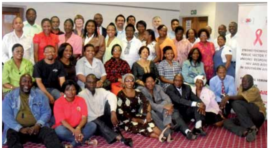
Regional seminar in Johannesburg, February 2011.

The report also emphasises the broader development context of the project and urges development planners and decision-makers to learn from it the many ways trade unions can contribute to policy formulation, planning and implementation.