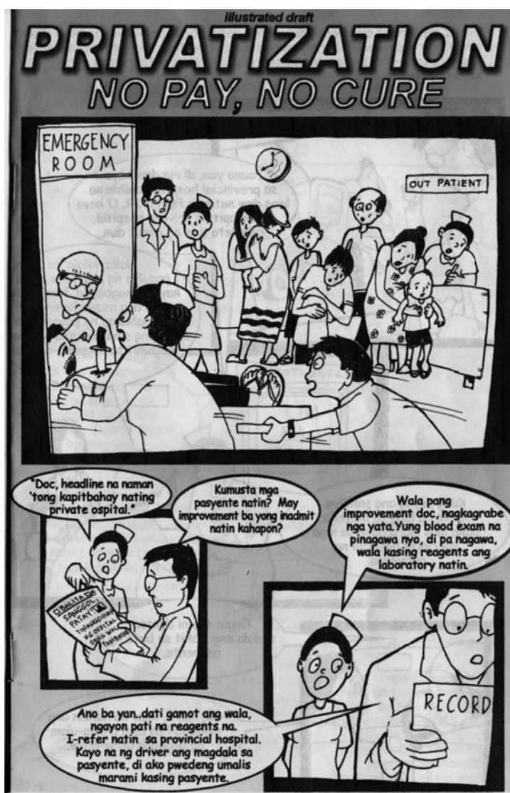
Illustrated primer on the effects of privatisation and national debt on the Philippines health system supported by UIDF © AVHRC

Water and health services are two of the most important public services for people in poorer countries. With the help of the UIDF, trade unions and workers' organisations were able to engage in these important debates and to inform the wider population of the importance of influencing policy decisions that affect the quality of people's lives.