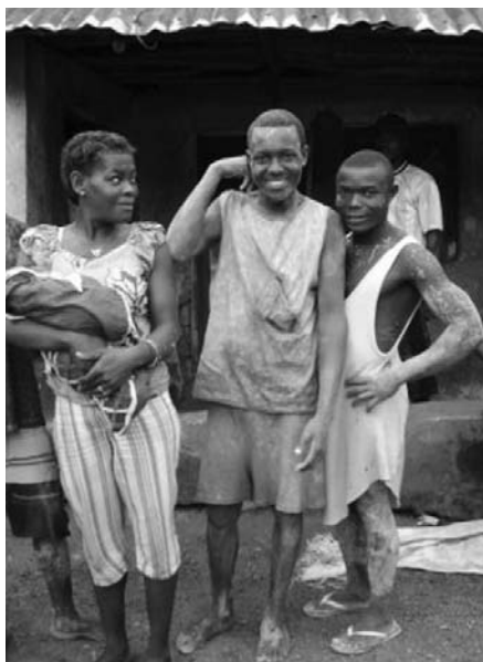
Diamond miners in Sierra Leone: A UNISON and TUC Northern region project is providing training in organising and recruitment to the Sierra Leone Mineworkers Union.

existing members, which include 217 women, trained in basic trade unionism as a result of the organising and education project implemented by the Free Trade Union of Cambodia. This tremendous achievement was made possible by UIDF funding.