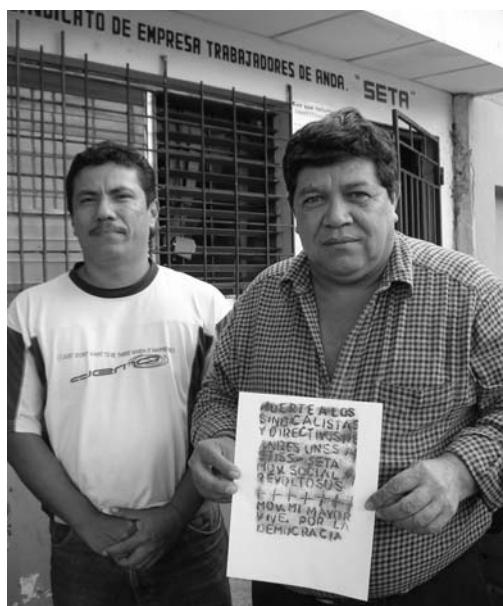
Members of the El Salvador water union SETA show death threat received during their campaign against water privatisation.

In Cambodia, some 4,793 new union members have been recruited and 300