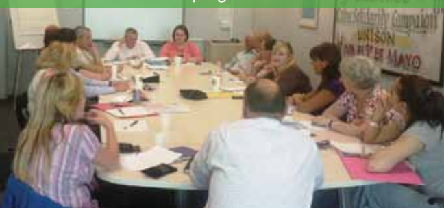
The North West team plan their organising in schools campaign

"On 20 April, I started my secondment with UNISON. I remember the feeling very well. There was a mixture of excitement, apprehension and fear. My first school visit was to one of the most notorious high schools in Salford. There was a large turnout and all eyes were on me and the area organiser. It was very daunting and I just wanted to run away. This was the first visit of many more to come and I could write a book on the issues raised by school support staff. Many are clinging to the hope that the new body will bring recognition and fairness. I do think that the project in Salford was a success; the recruitment figures and list of new contacts and stewards speak for themselves."