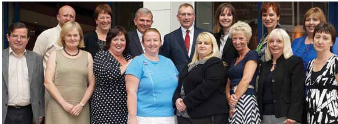
First meeting of the SSSNB in July – an historic moment

below) agreed that detailed work needed to take place in working groups. A group working on the core contract and working year and another on role profiles and job measurement are now in intensive talks. These are overseen by an executive group. The groups are meeting fortnightly and bulletins on their progress are being sent to branches. An SSSNB webpage has been designed so that members can access the latest bargaining news, visit: www.unison.org.uk/education/schools/SSSNB.asp